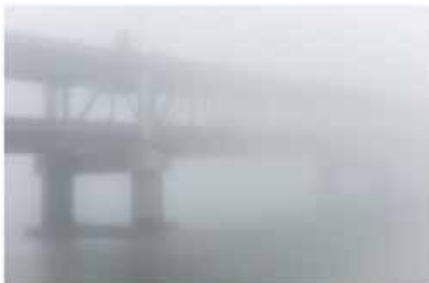
“Fog-bound Richmond Bridge” Richmond CA